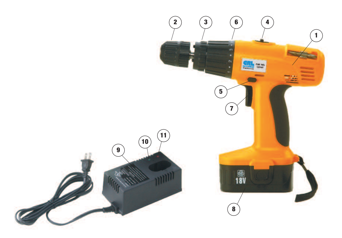
Diagram of the Cordless Drill

Do not dispose of NI-Cd batteries in household waste! The battery must be returned, in accordance with legislation on batteries, to the dealer or to the service center.