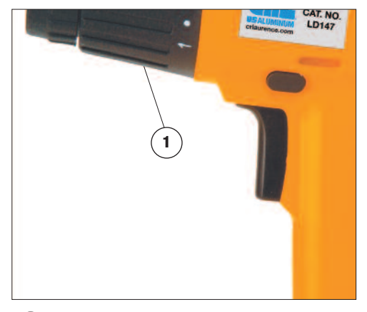
1) 17-Stage Torque Setter

CAUTION: Always start on the lowest setting. If the correct setting has been chosen, an override clutch opens once the screw has been turned flush into the material. When removing screws, select a higher setting or set to drill symbol. The proper settings are best determined in practice trials.