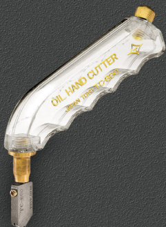
TC-600S Pistol Grip Supercutter®