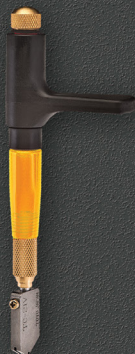
TC-21SVR Tap Wheel® Custom Grip Supercutter®